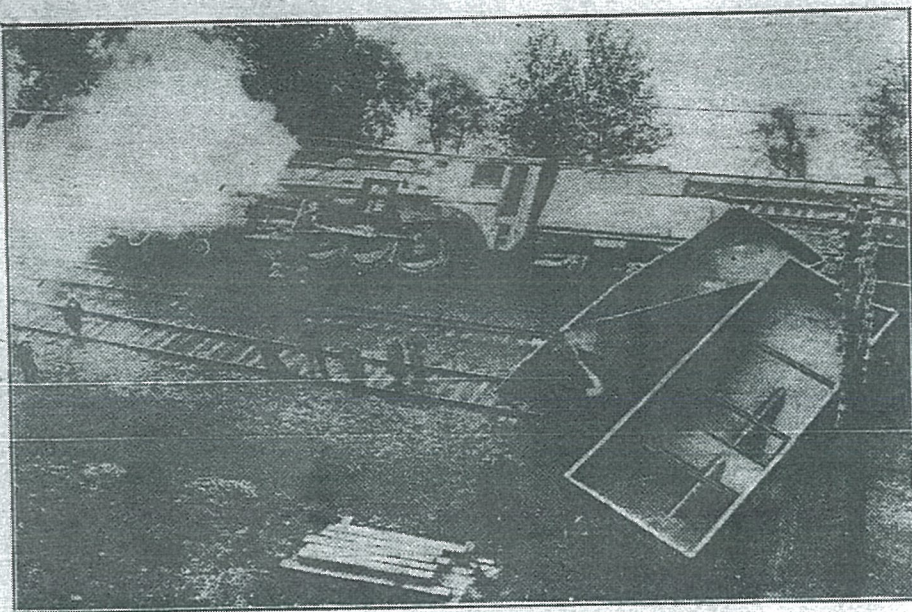
Two engines on freight train were derailed and went into ditch. Two freight cars were badly smashed. The crews jumped and escaped serious injury. The cause of the derailment is not known.

Scene of Wreck on C.P.R. Near Junction Cut Today