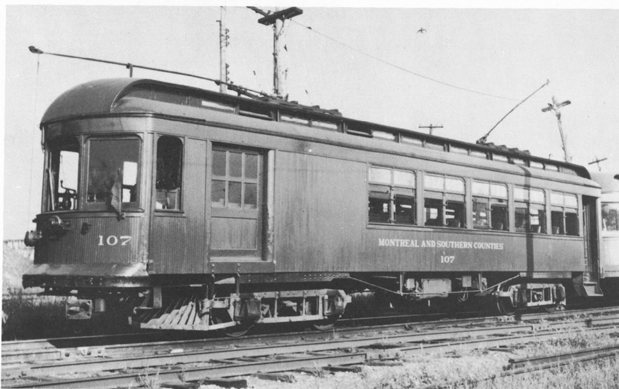
107 near Montreal terminal, August, 1947.